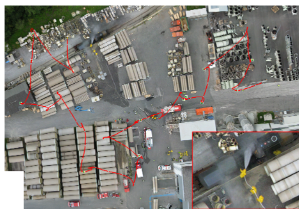
Figure 3. Overview image computed from a set of 40 pictures