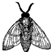
Figure 2: A sample black and white graphic (.eps format) that has been resized with the epsfig command.